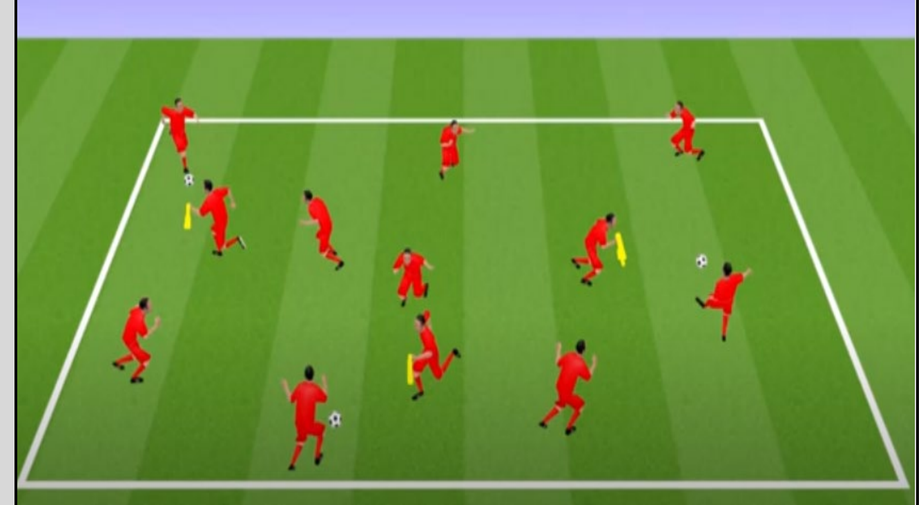
STATION 1: Which Way? (No Goals – With Endzones) VIDEO LINK CLICK HERE